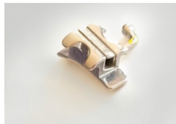
Hook with O22 Slot