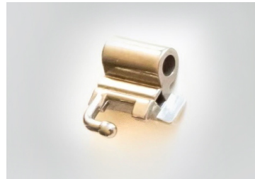
Hook with O22 Slot and Tube